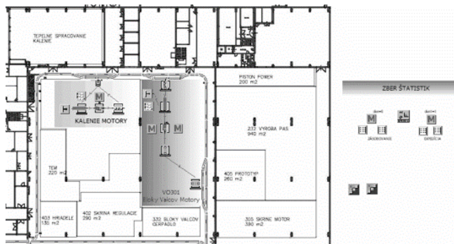
Figure 3. Created simulation model [Authors]

The next step is to create a simulation model in the Tecnomatix Plant Simulation environment for the proposed logistics circuits and selected workplaces. As a basis for model creation was used 2D layout of the plant. As a basis for model creation was used 2D layout of the plant.