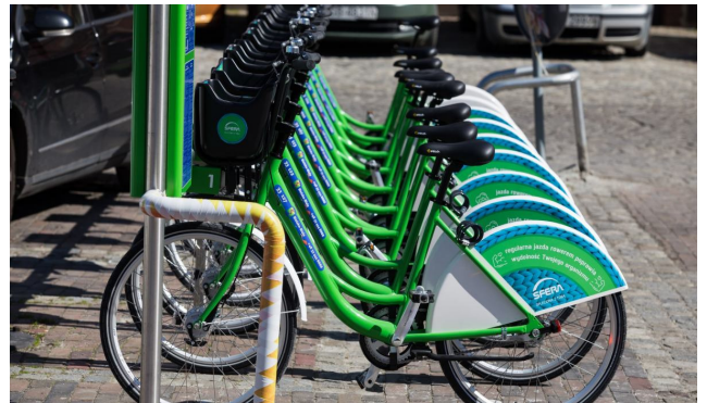
Fig. 2. An exemplary „Bbbike” urban bike station.

The article presents an analysis of bike rentals and returns to "BBbike" city bike stations located in Bielsko-Biała. The three months of 2019 and 2020 were compared. Based on the presented analysis, the following conclusions were formulated: