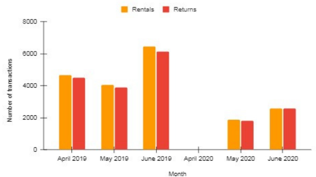
Fig. 4. Summary of the total number of rentals and returns, specified in specific months.